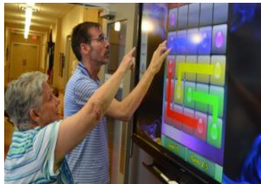
Participants using Smart Board

Families pay only half the actual cost per day because Amazing Place strives to keep its daily rates reasonable for the families who are in an already trying time. Approximately 19% of the families receive some form of scholarship.