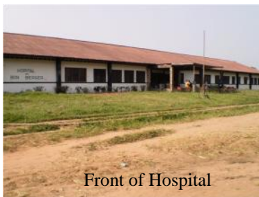
Front of Hospital

IMCK is a Christian primary health care facility and medical education center. Its services are centered at the Good Shepherd Hospital, which is a 140 bed facility about 10 miles outside of Kananga, in the Kasai Province of the DR Congo, and at PAX, a clinic located in the city of Kananga, that has 20 beds. General medicine, surgery, ophthalmology, pediatrics, gyn/obstetrics, dental services, radiology and lab services are provided. This faith-based organization has been in operation for almost 60 years. It is the largest Presbyterian affiliated hospital in the Democratic Republic of Congo.